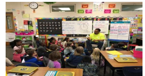
Real Men Read Day 2019

Alice Drive Elementary provides two reading interventionists through Title 1 funds to work with students who have been identified as needing additional support.